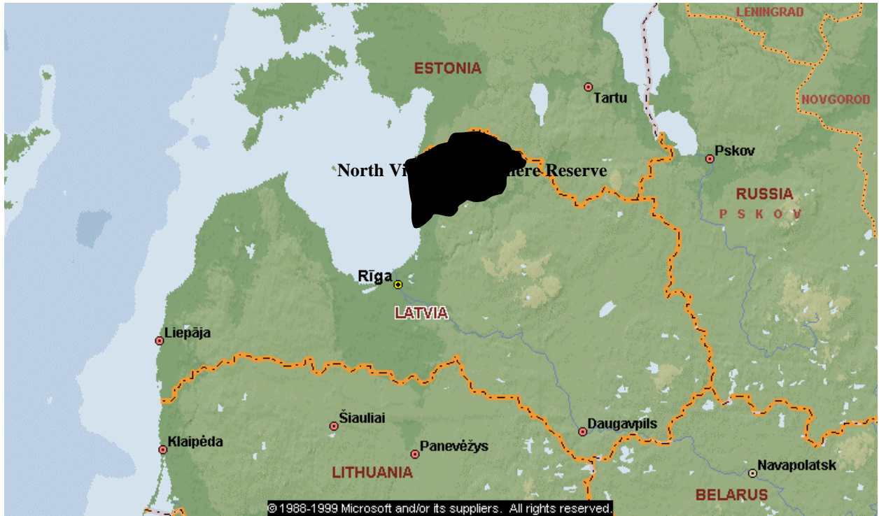
Figure 1: Location of North Vidzeme Biosphere Reserve - Latvia