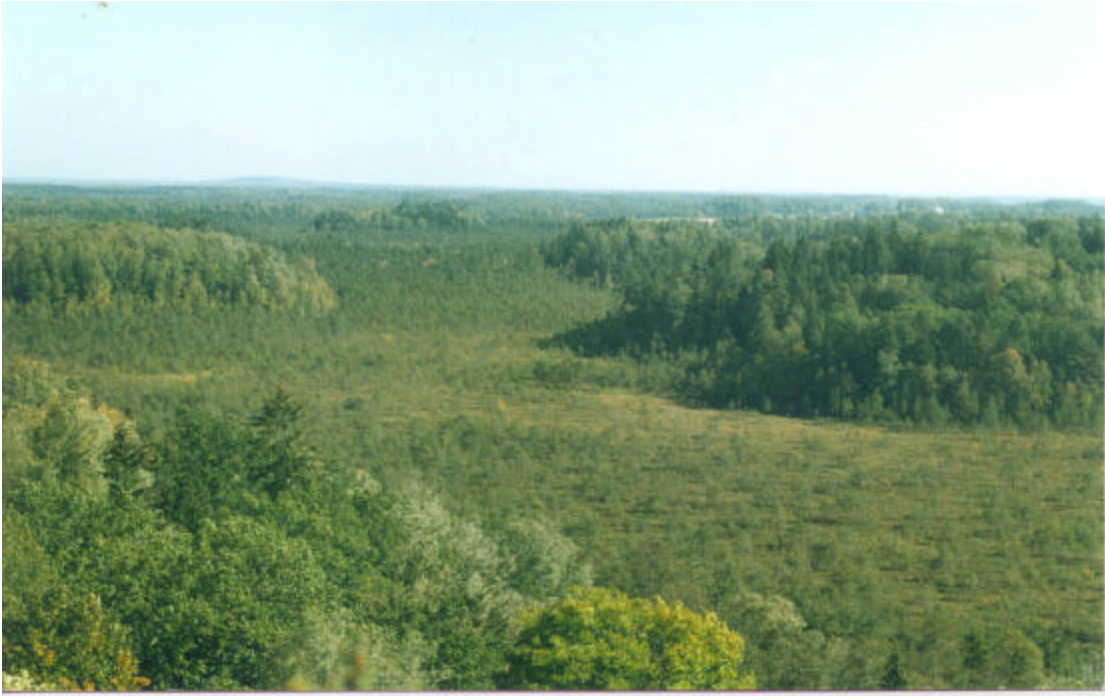
Figure 4: Core Area Northern Bogs