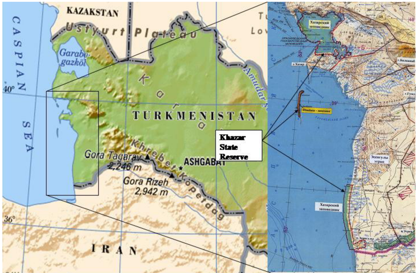
Map. Khazar State Reserve's three branches: Khazar, Ogurchinskiy Island and Essenguly branch.