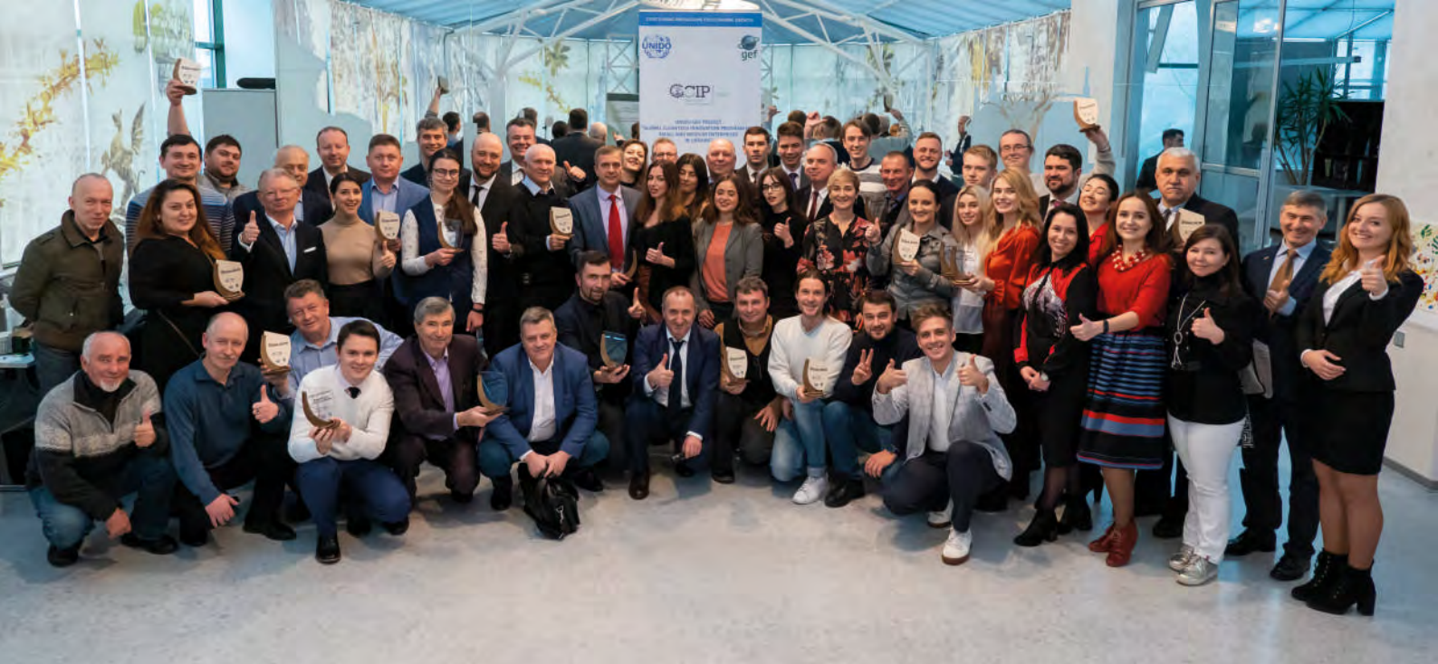
Award Ceremony of the finalists of first wave of GCIP Ukraine Accelerator