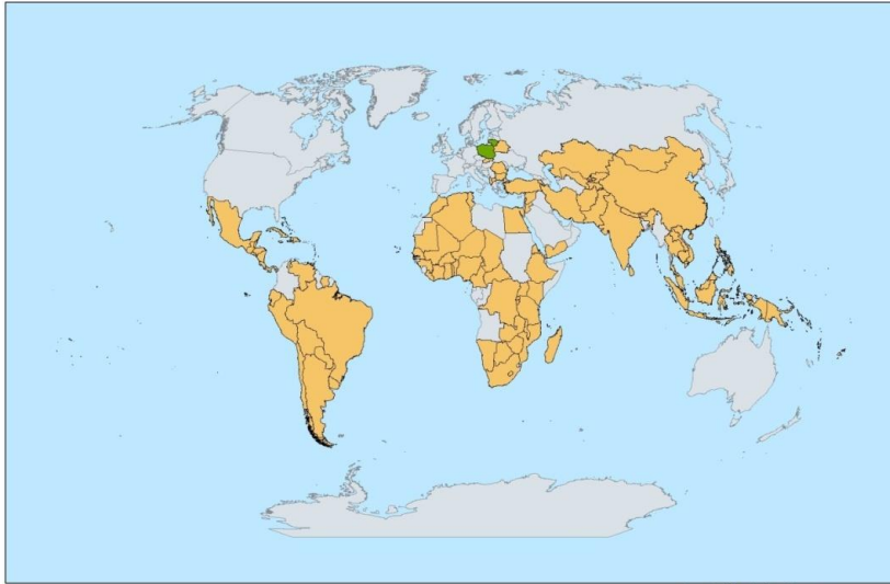
SGP Participating Countries

Created by Susan Chen GEF Small Grants Programme, UNDP 27 August 2009