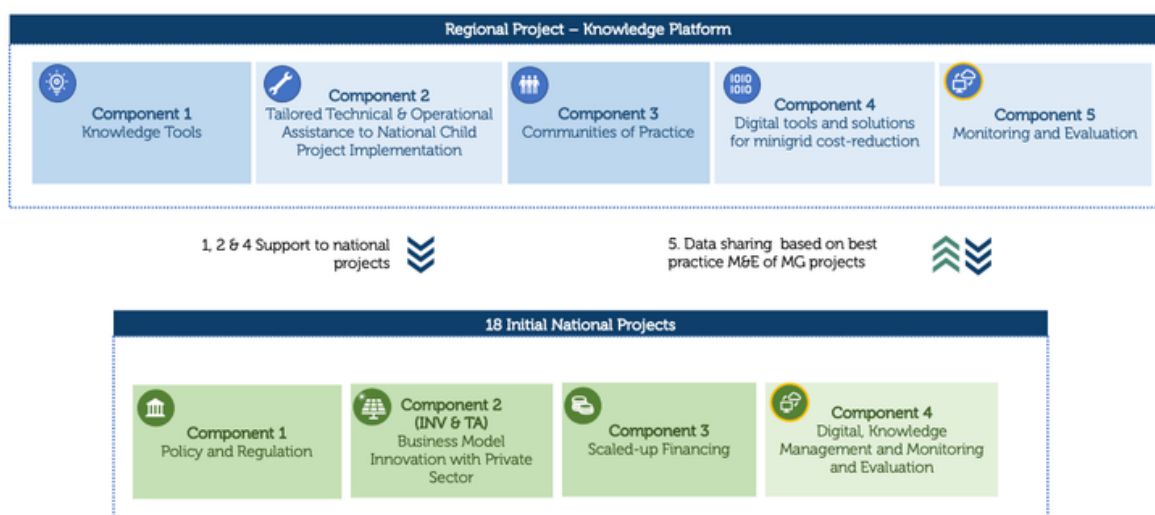
Figure 1: AMP Design