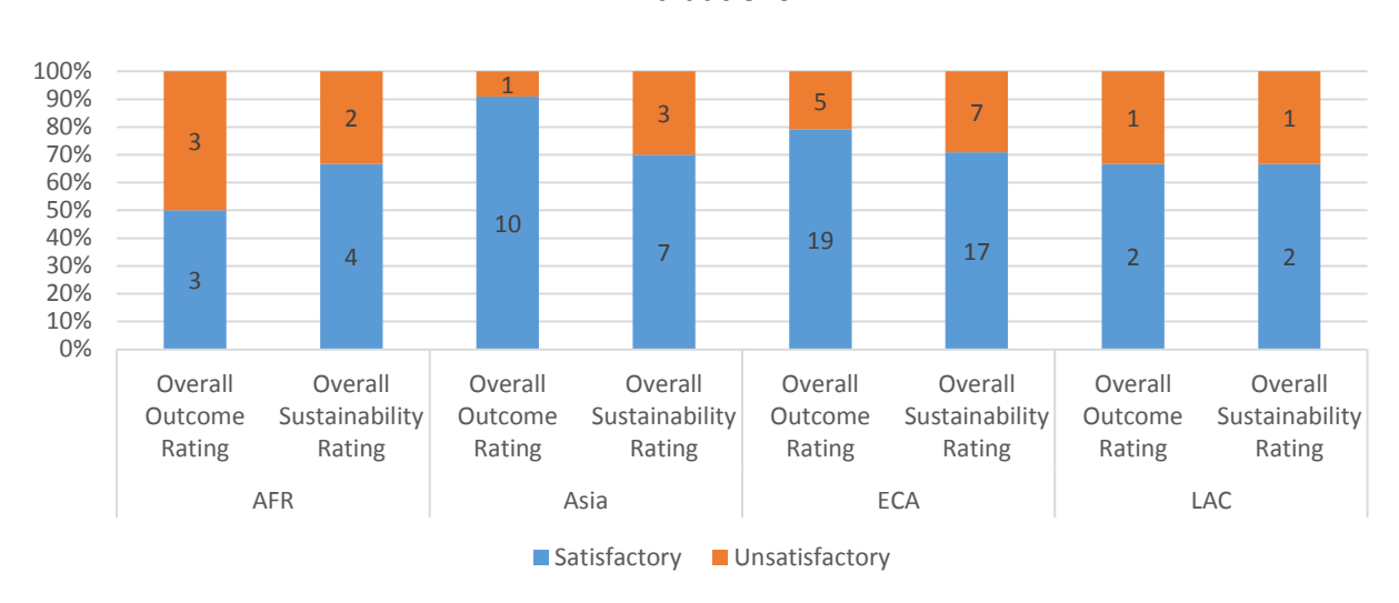
Figure 2: Outcome and Sustainability Ratings by Region for CW Projects with Terminal Evaluations

Figure 2 below shows the performance of closed CW projects with terminal evaluations by region.