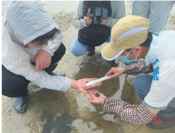
Figure 2. Citizen scientists monitor crab populations as part of the GEF-funded Citizen Science-based Beibu Gulf Coastal Wetland Conservation Action.