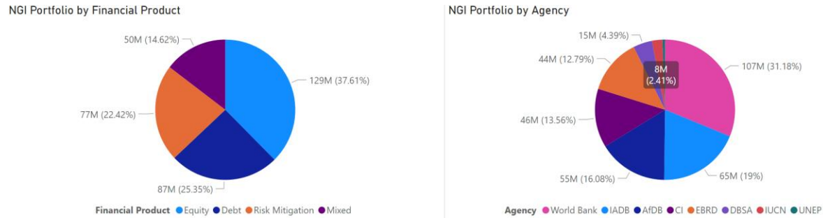
Figure 2: Allocation of NGI portfolio by Financial Product and Agency