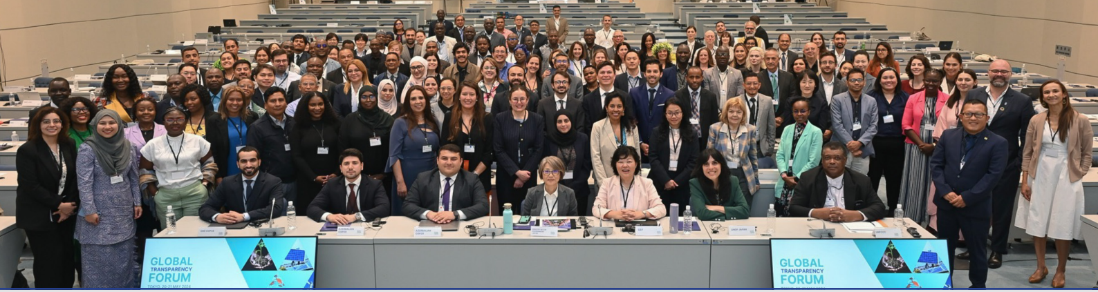
Global Transparency Forum, May 20-21, 2024, Tokyo, Japan