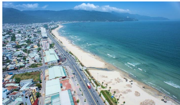
Da Nang's coastline