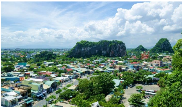
The Marble Mountains in the middle of Da Nang

GPSC’s event in Da Nang will demonstrate how cities can respond to their development challenges by tapping into the platform’s practical knowledge, scalable solutions, and financing opportunities which encourage urban solutions for environmental benefits. During the event UN-Habitat will be welcomed as a GPSC Knowledge Partner, along with the announcement that the International Finance Corporation (IFC) will join GPSC as an Investment Partner. An overview will be given of GPSC’s activities since being founded in 2016, along with the platform’s next steps heading towards GEF-7. Lastly, a panel comprising representatives from a diverse range of GPSC’s collaborators will discuss how cities can further leverage the solutions offered by GPSC to advance global environmental benefits. We hope you can join us for this event in Da Nang.