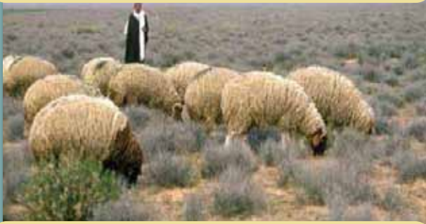
Livestock and Rangeland Management