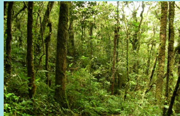
Sustainable Forestry Management