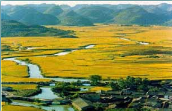
Sustainable crop production