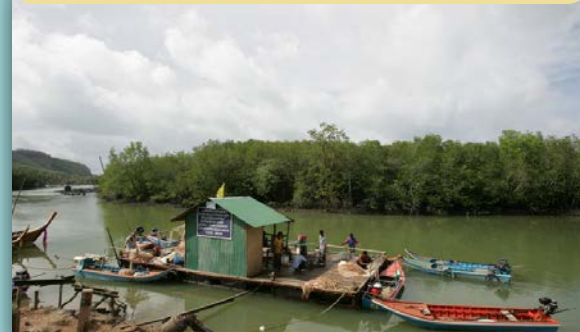
Sustainable Fisheries Management