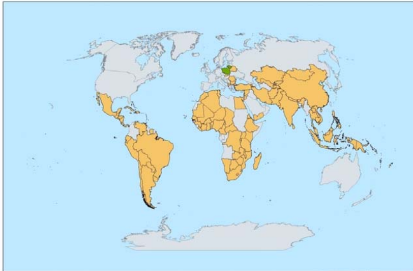
SGP Participating Countries

Created by Sulan Chen GEF Small Grants Programme, UNDP 27 August 2009