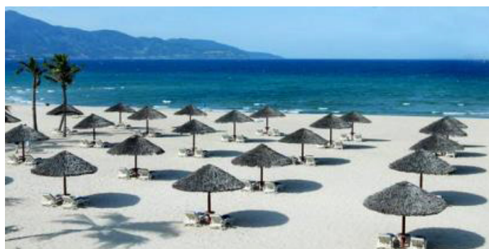
Beach area before and after rehabilitation