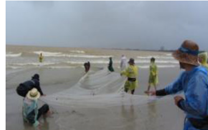
Fishing activity along the coast of Danang Bay

For those who opted to continue fishing, five new ships for offshore fishing worth VND 3.2 billion (US$ 153,000) were fabricated with support from the People's Committee of Danang City. In addition, the following assistance was provided: (1) insurance premium to some 3,000 crew members of fishing vessels with a capacity of over fifty CV; (2) construction of a sea products storage facility; and (3) aid to fishers switching jobs or support equivalent to roughly VND 4 billion (US$ 191,250). The City's program comprised of 660 fishing boats, with forty-two existing boats having been upgraded for offshore fishing, and was further enhanced with the construction of four safety stations.