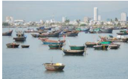
Fishing boats in Danang Bay