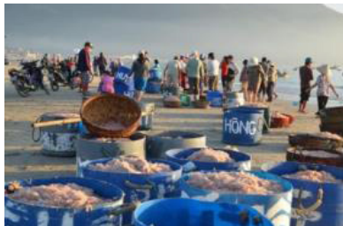
Fisheries landing site