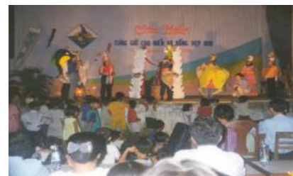
Public awareness activities involving the various sectors in Danang