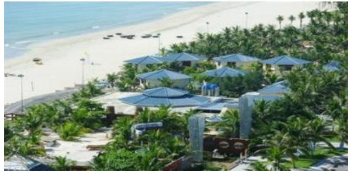
Beach area along Son Tra Peninsula

Both Son Tra and Ngu Hanh Son Districts have attracted numerous foreign and domestic investors to build 4-5 star vacation resorts of international standard. As a result, a significant increase in tourist arrivals has been recorded over the years (see box 1 for information on tourist arrivals in the first quarter of 2015), which provides tremendous job opportunities for local people and brings revenue to the district as well as to the City.