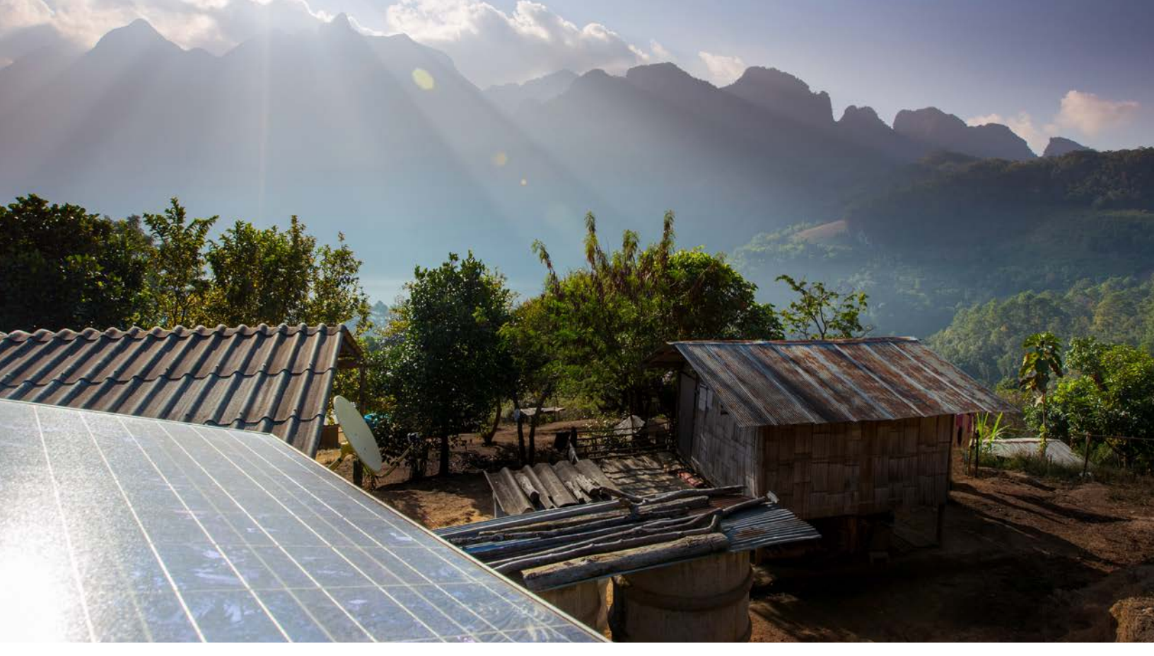
The GEF has experimented with Blended Finance for several years, initially mostly focusing on renewable energy and energy efficiency. As sustainable energy technologies began achieving significant cost-reductions and countries put in place enabling policy environments (e.g., feed-in-tariffs, power purchase agreements) the opportunity for private sector investment expanded greatly. The use of GEF funds to support equity investments proved especially attractive for supporting small scale clean energy projects.