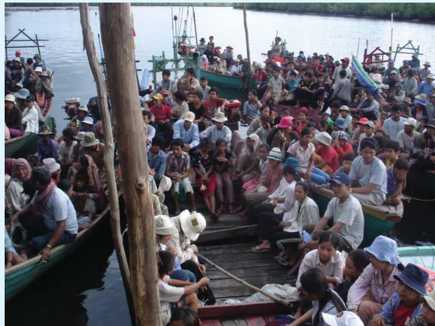
Mangrove and seagrass rehabilitation, protection, and conservation for livelihood improvements, Cambodia