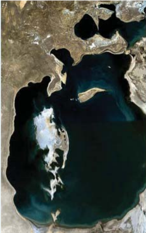
JULY – SEPTEMBER, 1989