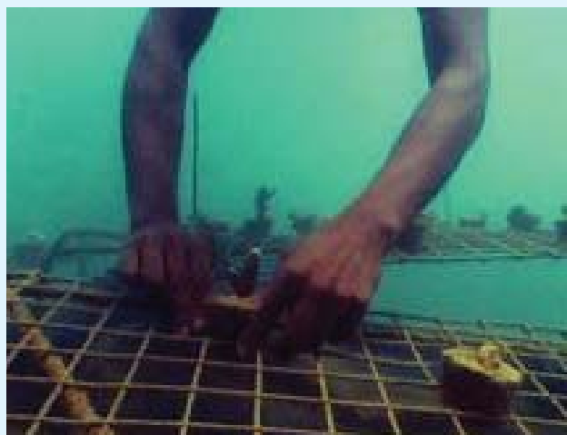
Coral replanting: photo courtesy of the SGP-Sri Lanka