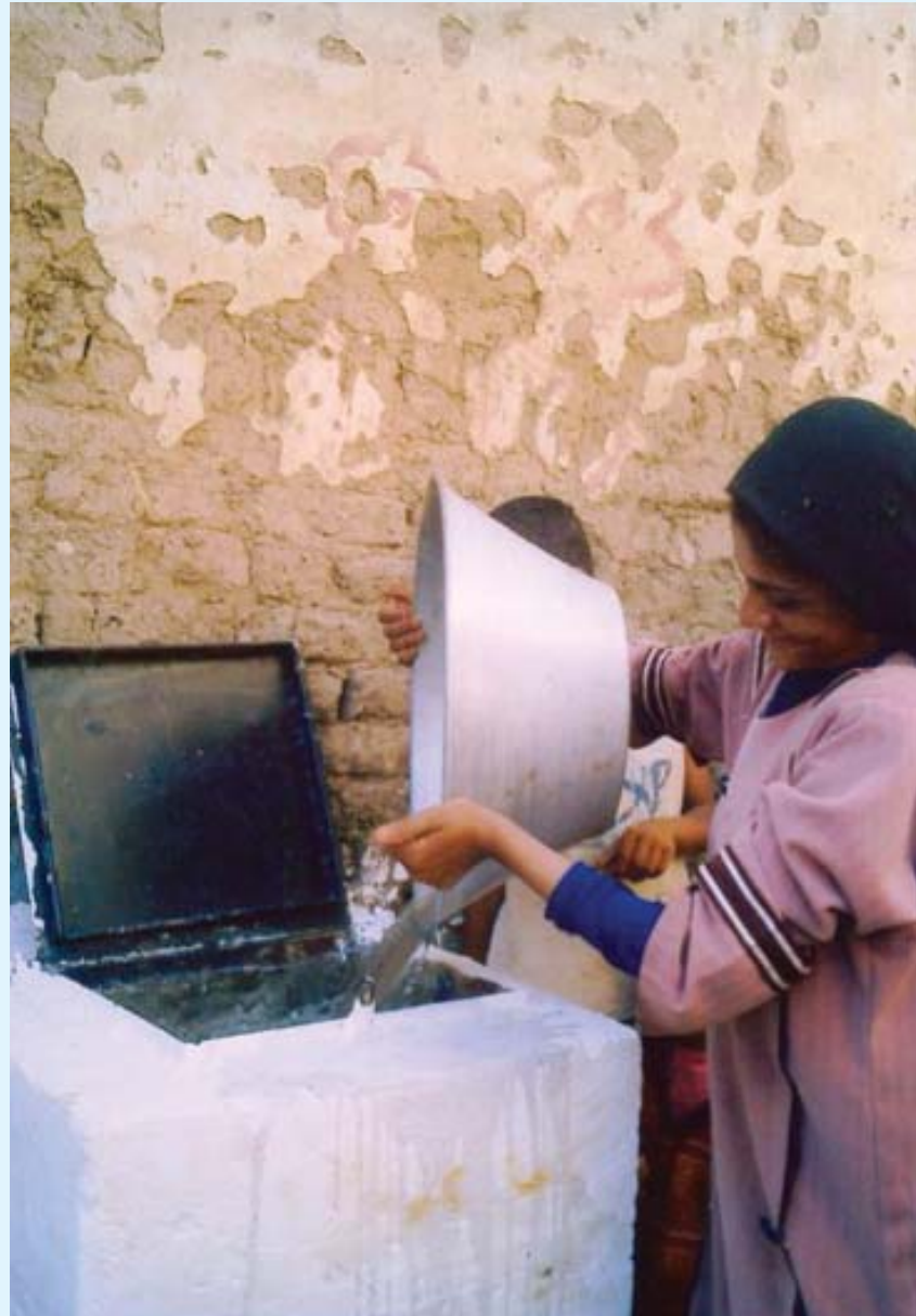
Grey water treatment and protection of fresh water sources, Nile River