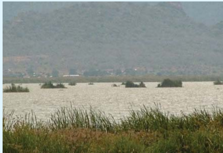
Lake Jipe before and after restoration activities: photos courtesy of SGP-Kenya Before the project (left), Lake Jipe was drying up and inundated with cattails. Rehabilitation through SGP supported projects raised water levels (right).