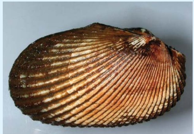
Restored mollusk populations. Both the Anadara Tuberculosa (left) and Anadara Similis (right) populations were controlled by allowing populations to grow in corrals and not be collected until certain sizes were reached: photo from: National Biological Information Infrastructure, Ecuador.