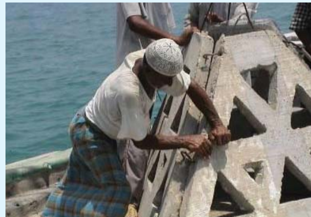
Artificial reef construction — locals poured concrete into models to create triangular pieces (above) which were weighted to the sea floor and later became the perfect habitat for corals (below).