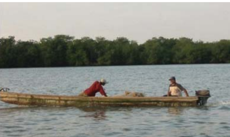
Fishing off Costa Rica Island