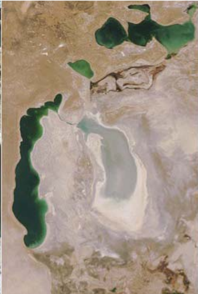
OCTOBER 5, 2008

The Aral Sea: photo courtesy of the National Aeronautics and Space Administration (NASA)