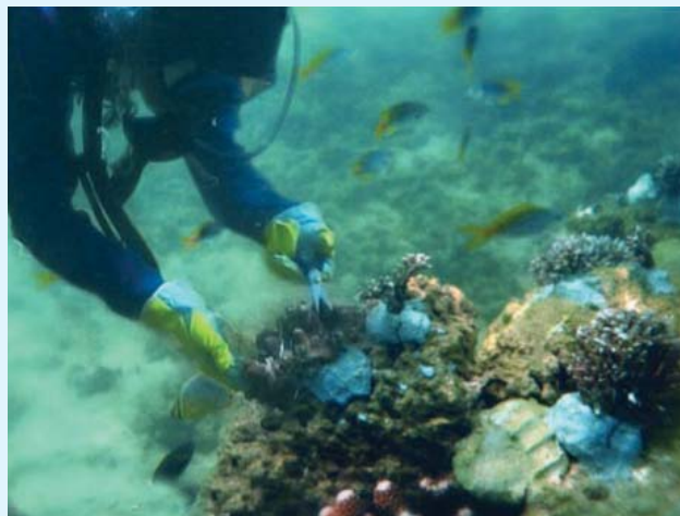
Community coral restoration and replanting (top and above), Sri Lanka