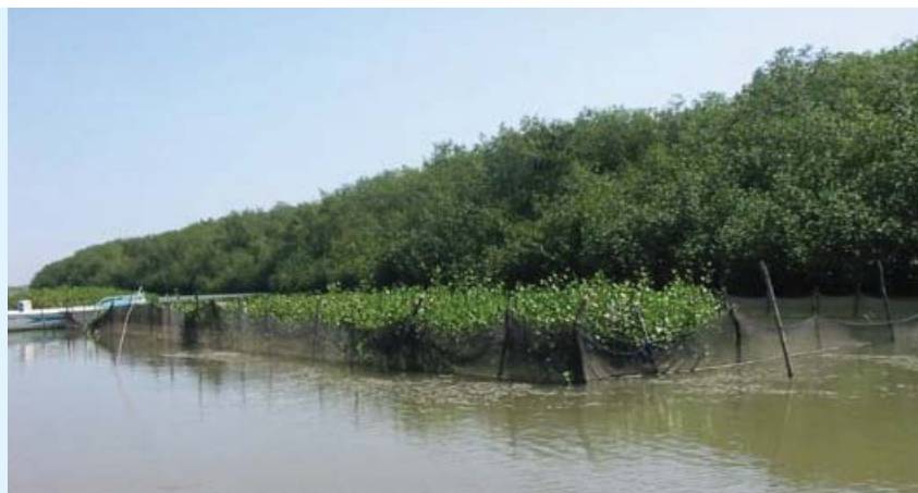
Protection of mangrove swamp: photo courtesy of SGP-Ecuador